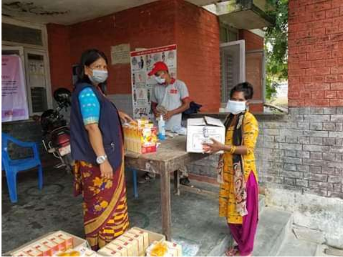
Fig: Handover of Sarvottam litto, mask and soap by Acting-chairperson of Pratappur RM.