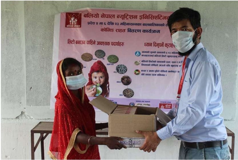
Fig: Litto handover by Program Manager of BNNI