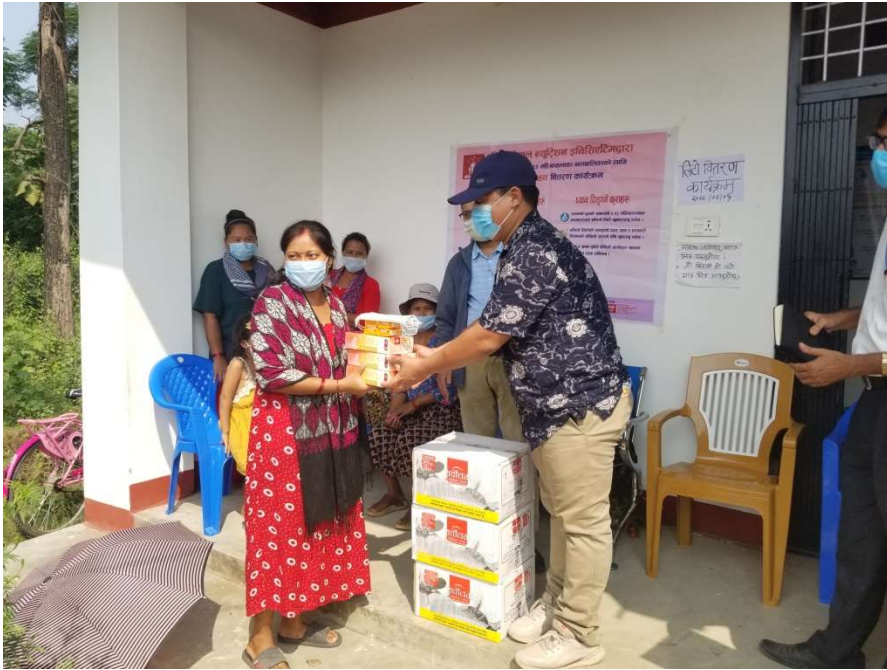
Fig: Handover of Posilo litto, soap and mask by Executive Director of KSSC to baby mother