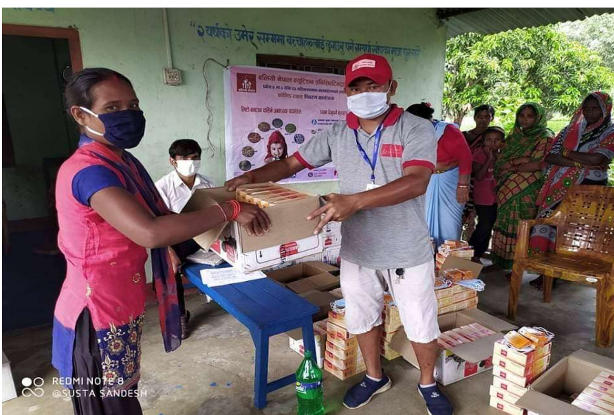
Fig: Handover of Nutrition Package by FS: