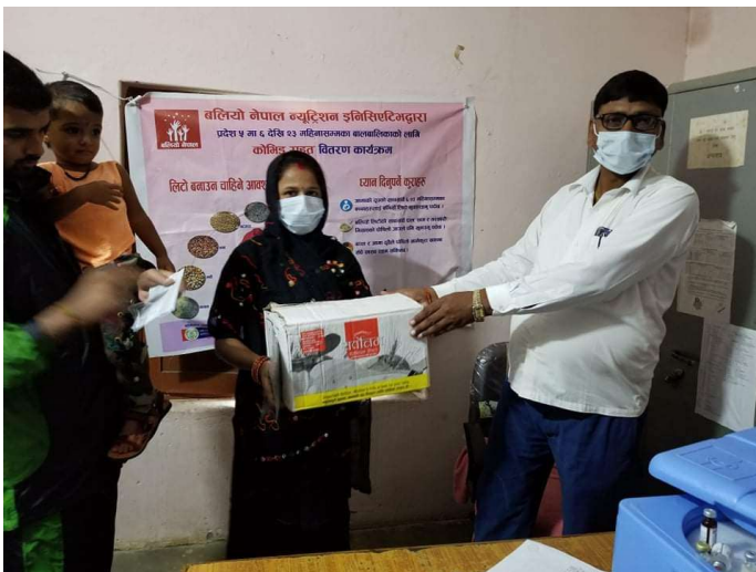
Fig: Handover of nutrition package by Hapur H.P Incharge to 18 months baby mother