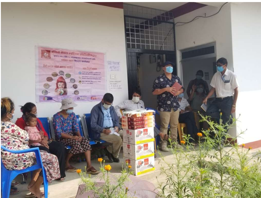
Fig: Objectives sharing of program by Executive Director of KSSC and sunwal municipality.