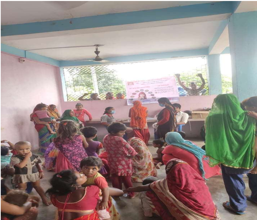
Fig: Objectives sharing of the program