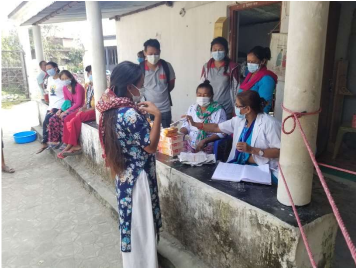
Fig: Monitoring of distribution site at sunwal municipality