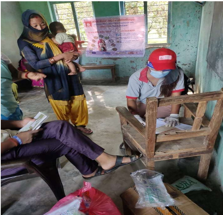
Fig: Registration of baby and mother